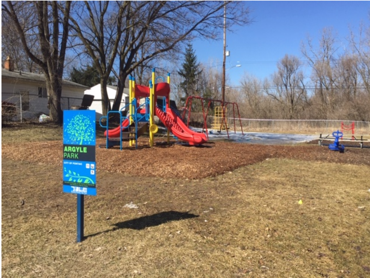
Argyle Park Playscape – 2018 NEP