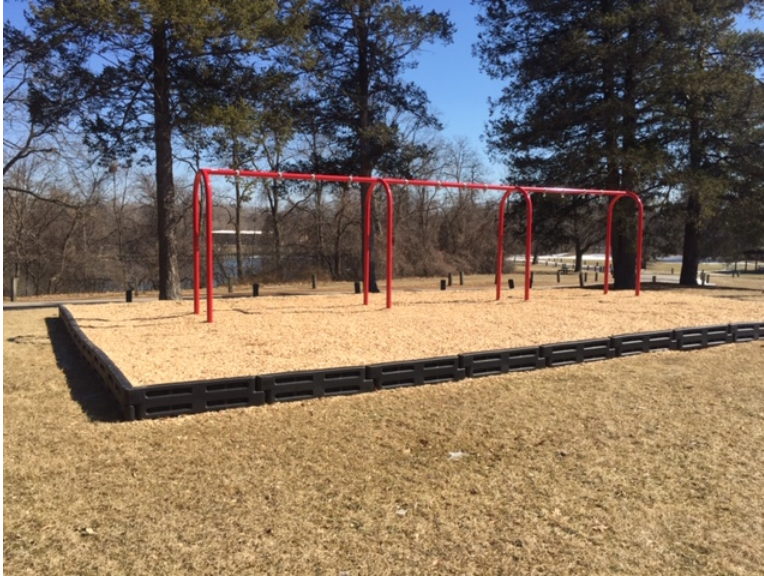
Beaudette Park Playscape 2018 NEP