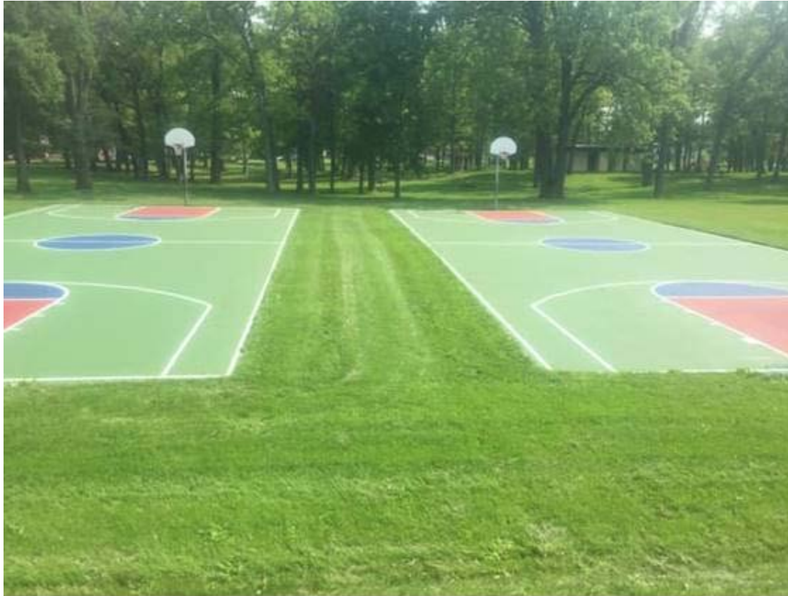
Oakland Park Basketball Courts 2018 NEP