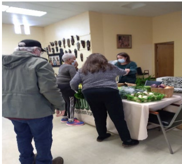
Sprout – Thursday 12:30 – 1:30 Fresh fruits and vegetables

Year's Eve New Year's Day Dr. Martin Luther King Jr. Day Veteran's Day President's Day Good Friday Memorial Day Juneteenth Day Independence Day Labor Day Thanksgiving Day and the day after Christmas Eve and Christmas Day