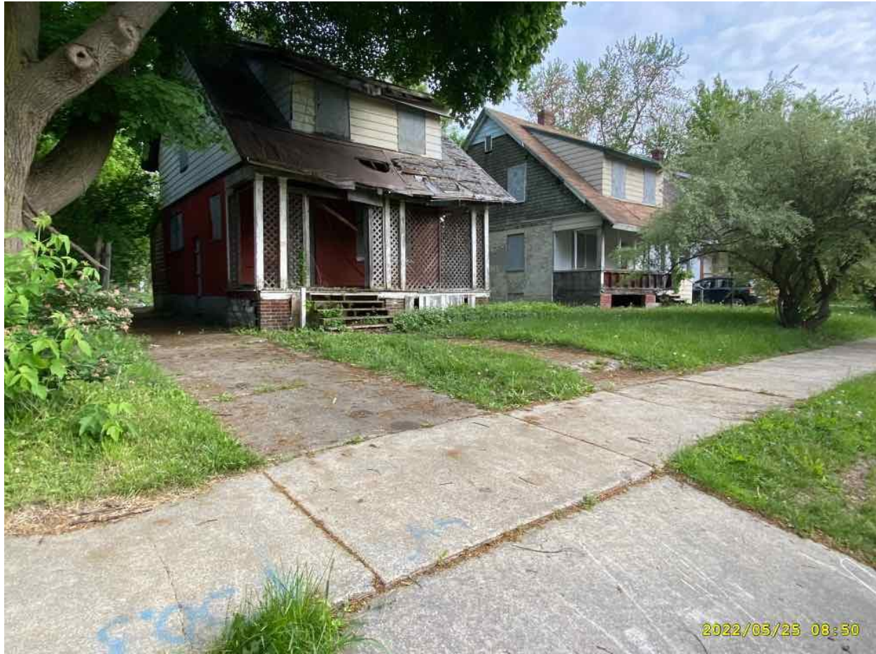
Figure 2: Rear View of the Subject Structure

The Oakland County Land Bank Authority received a grant to stabilize three structures in the Modern Housing Corp Historic District. The other two properties, 79 Oliver and 595 N Perry, are proposed to be restored, but due to the significant cost of restoring 75 Oliver the applicant is proposing a demolition.