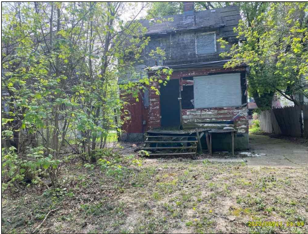
Figure 3: Front Façade of 75 Oliver St.