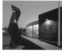
Shirrod Heritage Addition — Neill Public Library