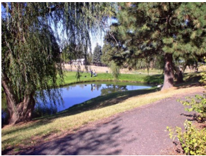
Pullman—the city of parks and paths

Although federal and state dollars for local funding are shrinking, we can continue to work to make our quality of life even higher. Your donations are one way of achieving this goal. Your support will make Pullman an outstanding community for years to come.