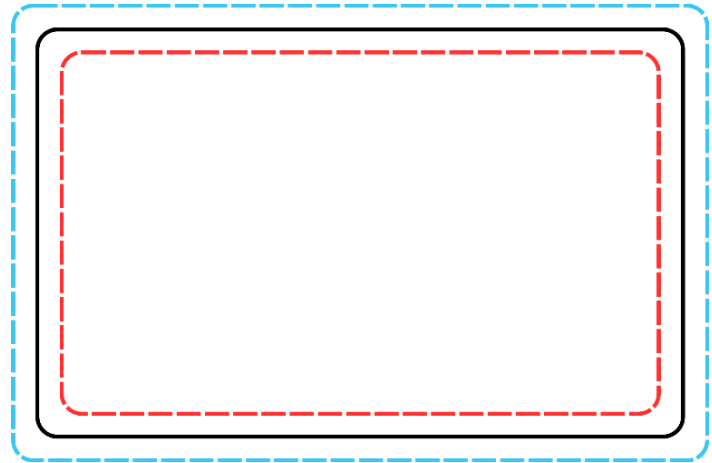
Actual Size of Library Card

Feel free to print this template at a LARGER SIZE to create your artwork, as long as the ratio remains the same, but keep in mind that small design elements will be even smaller when adjusted to fit actual size. For your convenience, a large-scale version of the template is available on the last page of this packet.