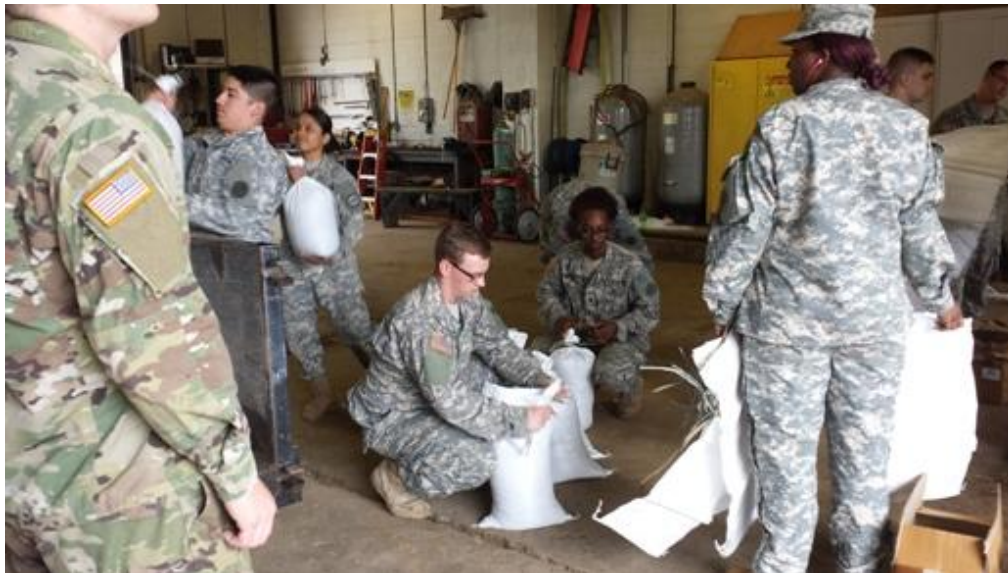
A HELPING HAND - The New York State Army National Guard is stationed in Oswego County for the week to assist with sandbag filling and distribution.

Flood mitigation and recovery information, including sandbag and levee instructions, clean-up guidelines and home repairs, is posted on www.oswegocounty.com . For those with questions about safe well water and septic system issues, call the Oswego County Health Department's Environmental Division at 315-349-3557.