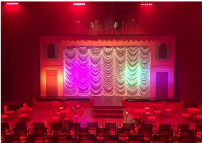
Redhouse Arts Center – Syracuse, NY