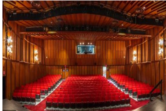
Lake Placid Center for the Arts – Lake Placid, NY