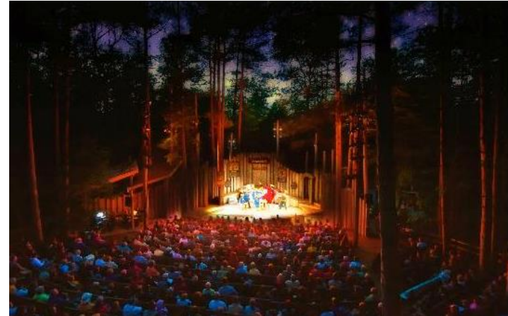
Northern Sky Amphitheater - Fish Creek, WI