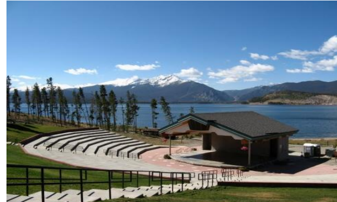
Lake Dillon Amphitheater – Dillon, CO