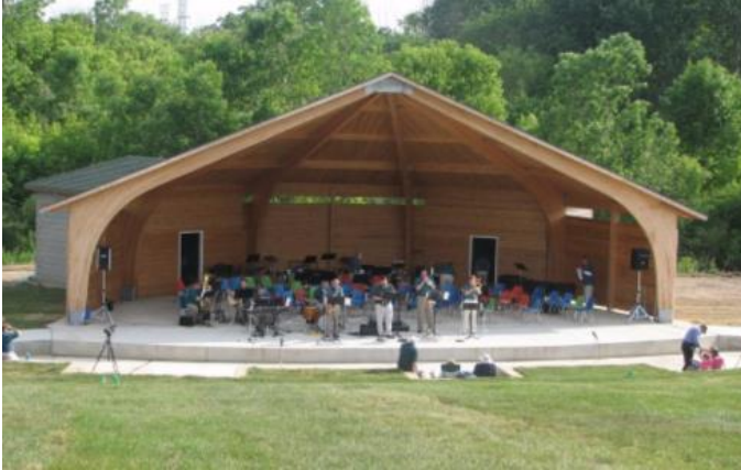
Wildwood Amphitheater – Orion, MI