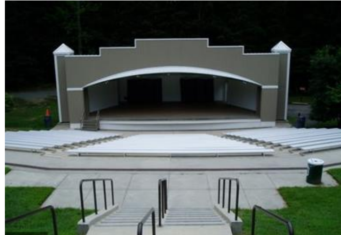
Jean C. Smith Amphitheater – Triangle, VA