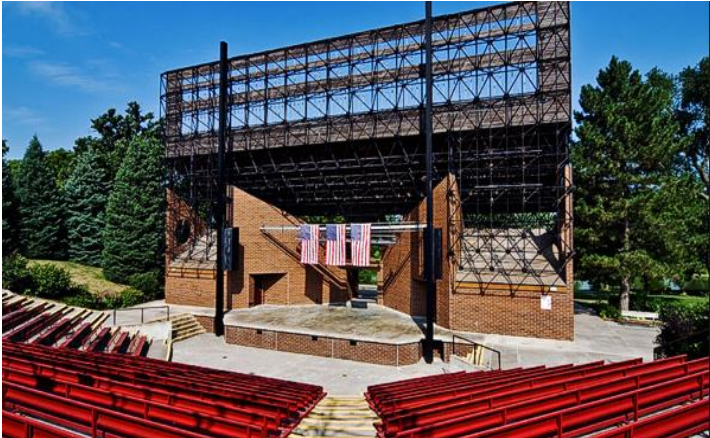
Davis Amphitheater at Glenwood Park - Glenwood, IA