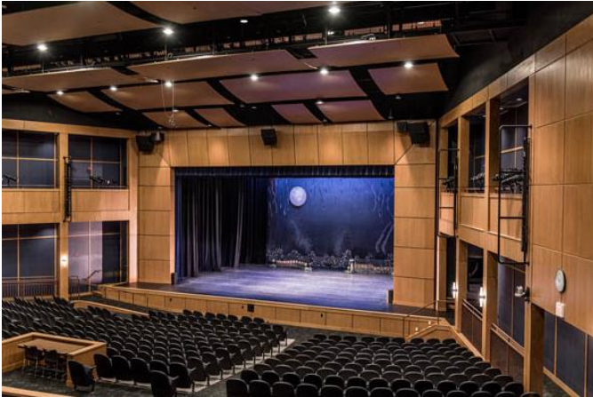
Westbrook Performing Arts Center – Westbrook, ME