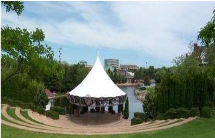
Hughes Amphitheater – Edina, MN