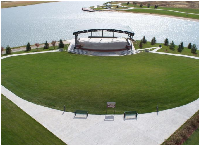
Cope Amphitheater – Kearny, NE