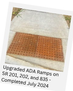
Upgraded ADA Ramps on SR 201, 202, and 835 - Completed July 2024