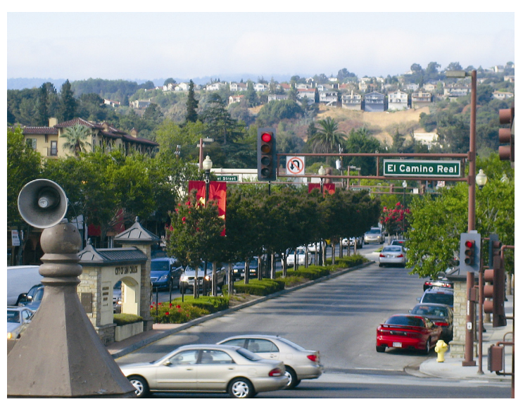
View of Downtown from San Carlos train station

would eliminate the low frequency rumble associated with diesel-powered locomotives. However, overall high-speed train noise levels may increase over conventional trains due to the aerodynamic effects. Vibration of the ground caused by the passby of high-speed trains is expected to be similar to that caused by conventional steel wheels/steel rail trains. As information becomes available, it should be incorporated into the Noise Element and utilized accordingly in noise/vibration and land use planning.