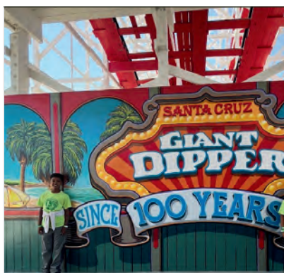
EXTREME ADVENTURE CAMP

Your Summer, Your Adventure, Camps Made Just for YOU!