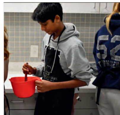
Advanced Culinary Arts