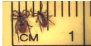
Western Black Legged tick Female (L) Male (R)

Some people infected with Lyme disease may not experience any symptoms until weeks, months or even years after they have been infected. Always consult your doctor with questions.