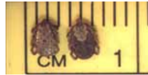
Pacific Coast tick Male (L) Female (R)