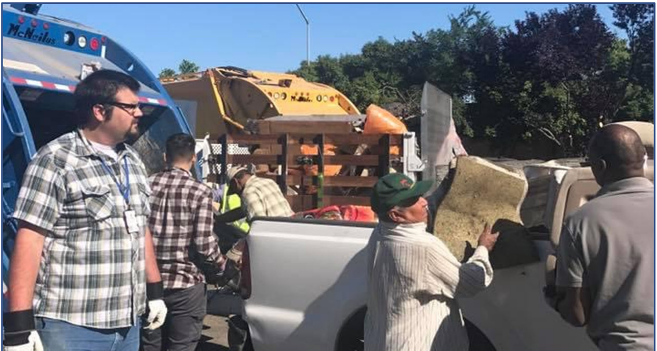
Above: Staff from Neighborhood Services help a resident unload at the Neighborhood Betterment Team Cleanup event held on April 24 off of Kelley Drive.

Appendix C provides the detailed breakdown by event.