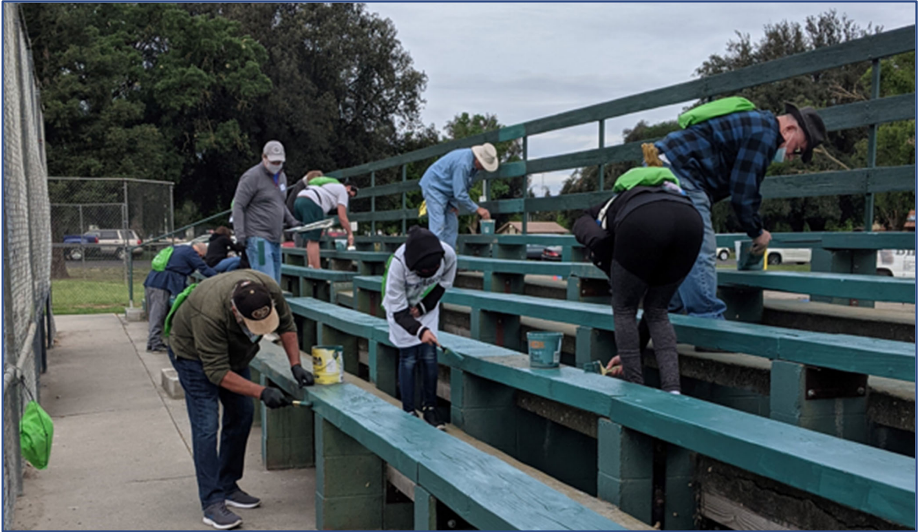
Above: Volunteers from Northern Little League, Quail Lakes Baptist Church, and Church of Latter-Day Saints paint the baseball bleachers at the Community Cleanup event held on April 24 at Oak Park.

Based on interest from community groups, cleanup events adapted into minor beautification projects to accompany litter abatement. For beautification efforts, most cleanups focused on painting of walls, benches, and picnic tables and/or heavy pruning of shrubs. The July cleanup at Pixie Woods was the exception, with volunteers from multiple skilled labor union groups who performed structural repairs to buildings, including a roof replacement.