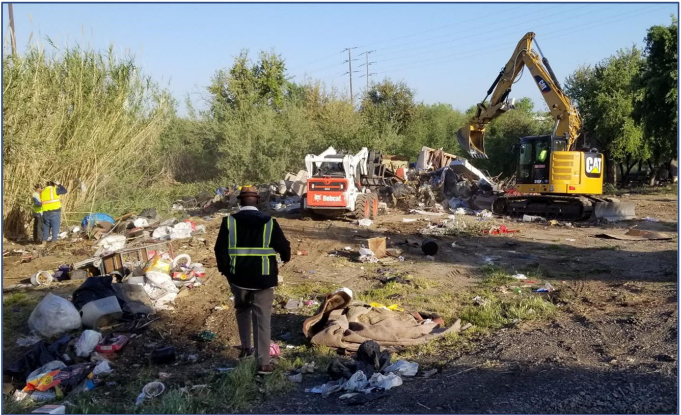
Above: The Police and Public Works Department are shown conducting a Homeless Encampment Cleanup event on April 23 at Mormon Slough near Commerce Street.

Appendix D provides the detailed breakdown by event.