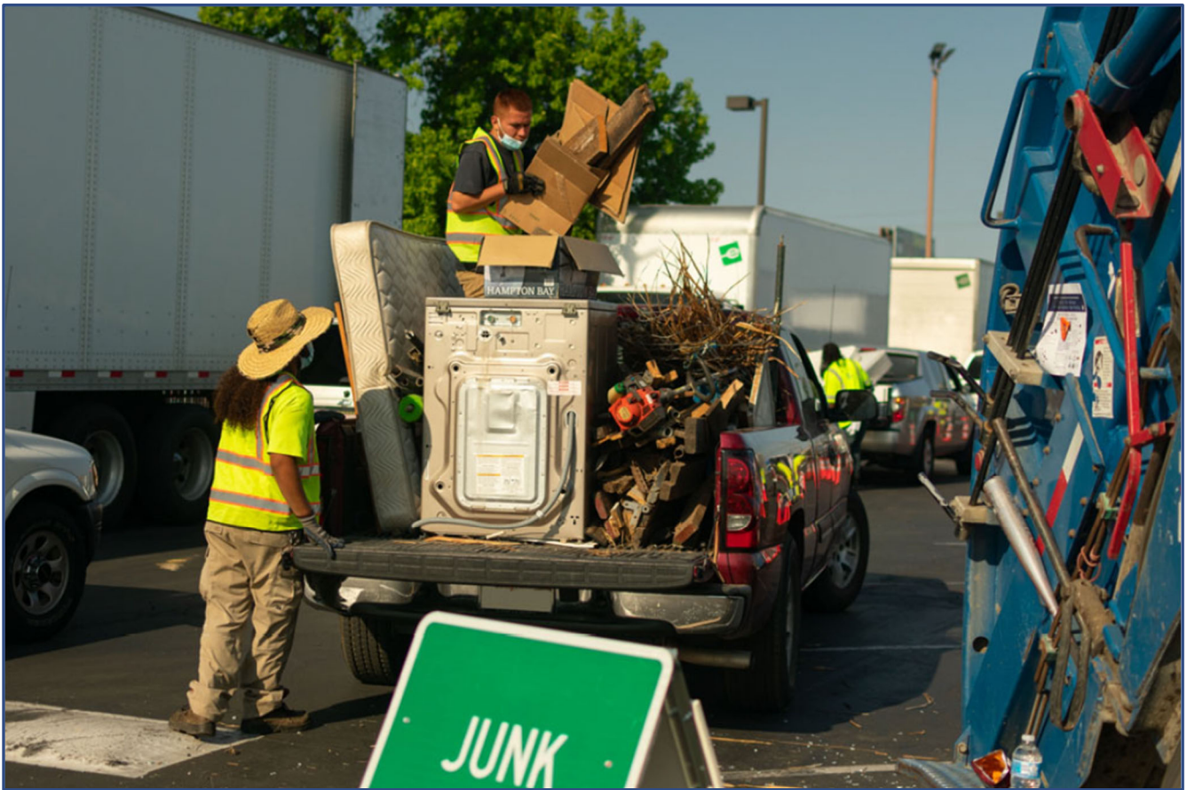
Above: San Joaquin Greater Valley Conservation Corps members unload a pickup at the Drive-Thru Recycling event held on June 19 at the West Lane Bowl parking lot.

A favorite giveaway for participants at these events is bags of compost. There were 3,600 compost bags provided.