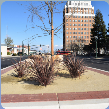
Drought tolerant median landscaping