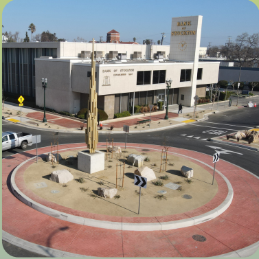
Round-About Miner Avenue & San Joaquin Street