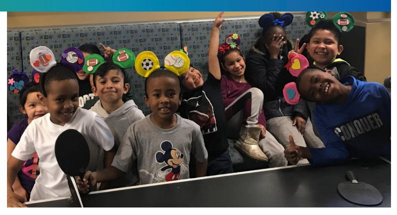
"Building resilient communities by cultivating healthy bodies and curious minds."