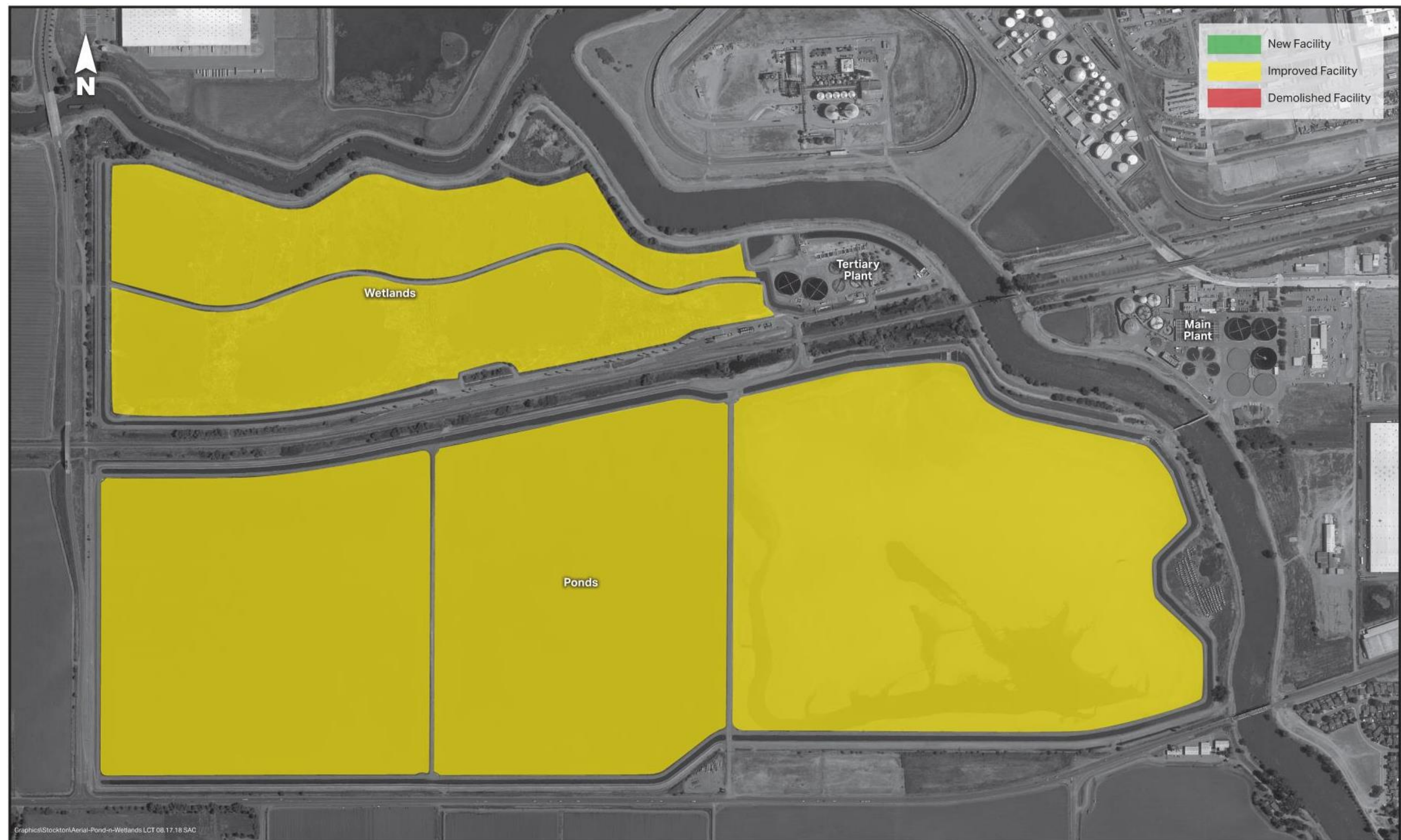
Figure 4-3. City of Stockton RWCF Project Scope – Storage