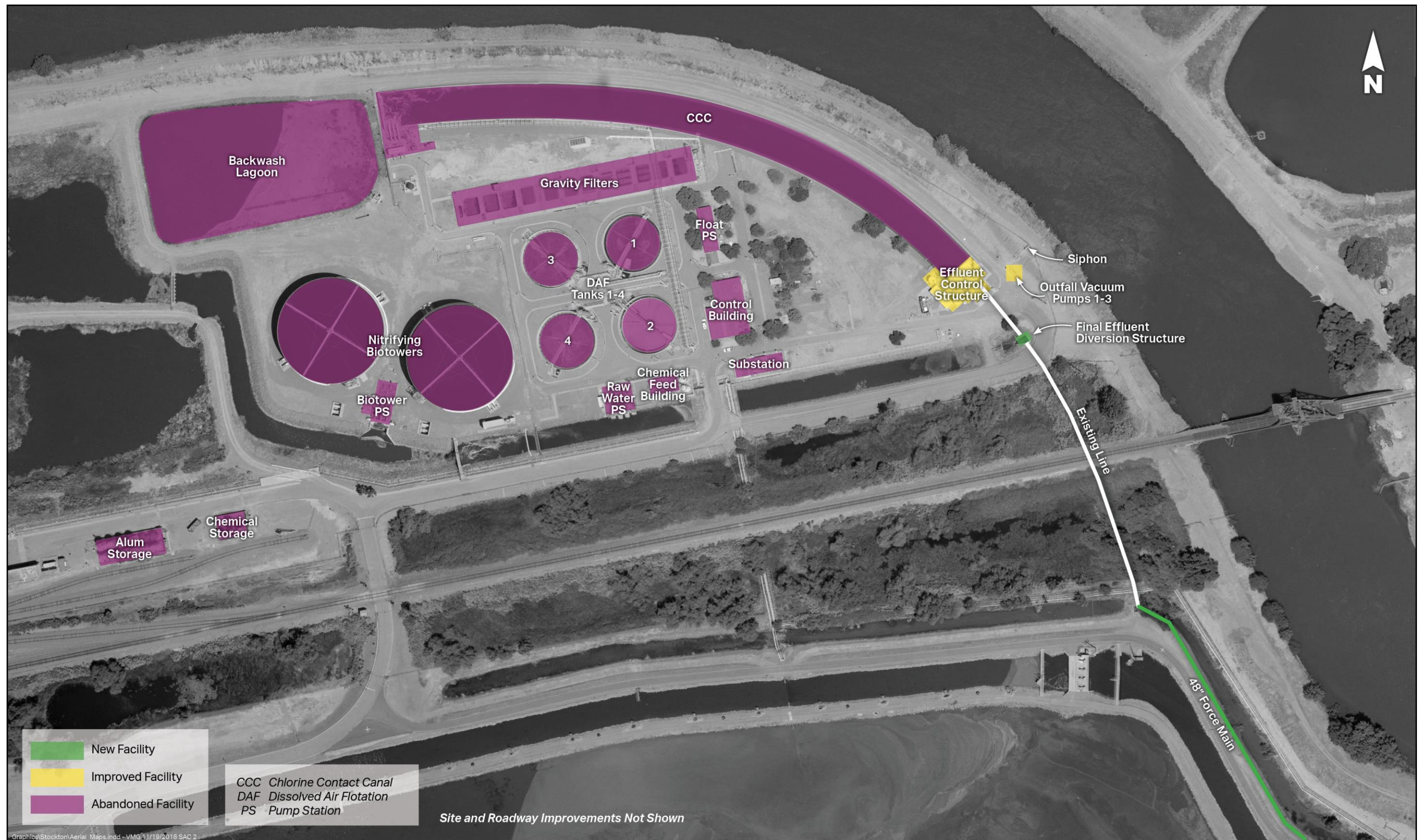
Figure 4-2. City of Stockton RWCF Project Scope – Tertiary Plant Area