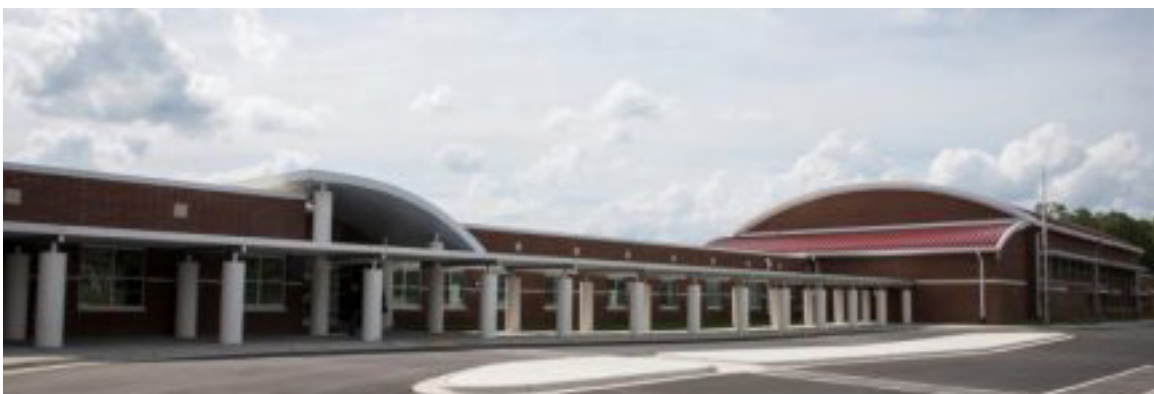
Elon Elementary School

Located in Alamance County, Elon is part of the Alamance Burlington School System. The Town is served by Elon Elementary, Western Middle School, and Western High School. The Alamance Burlington School System has over 22,000 students attending the K-12 system.