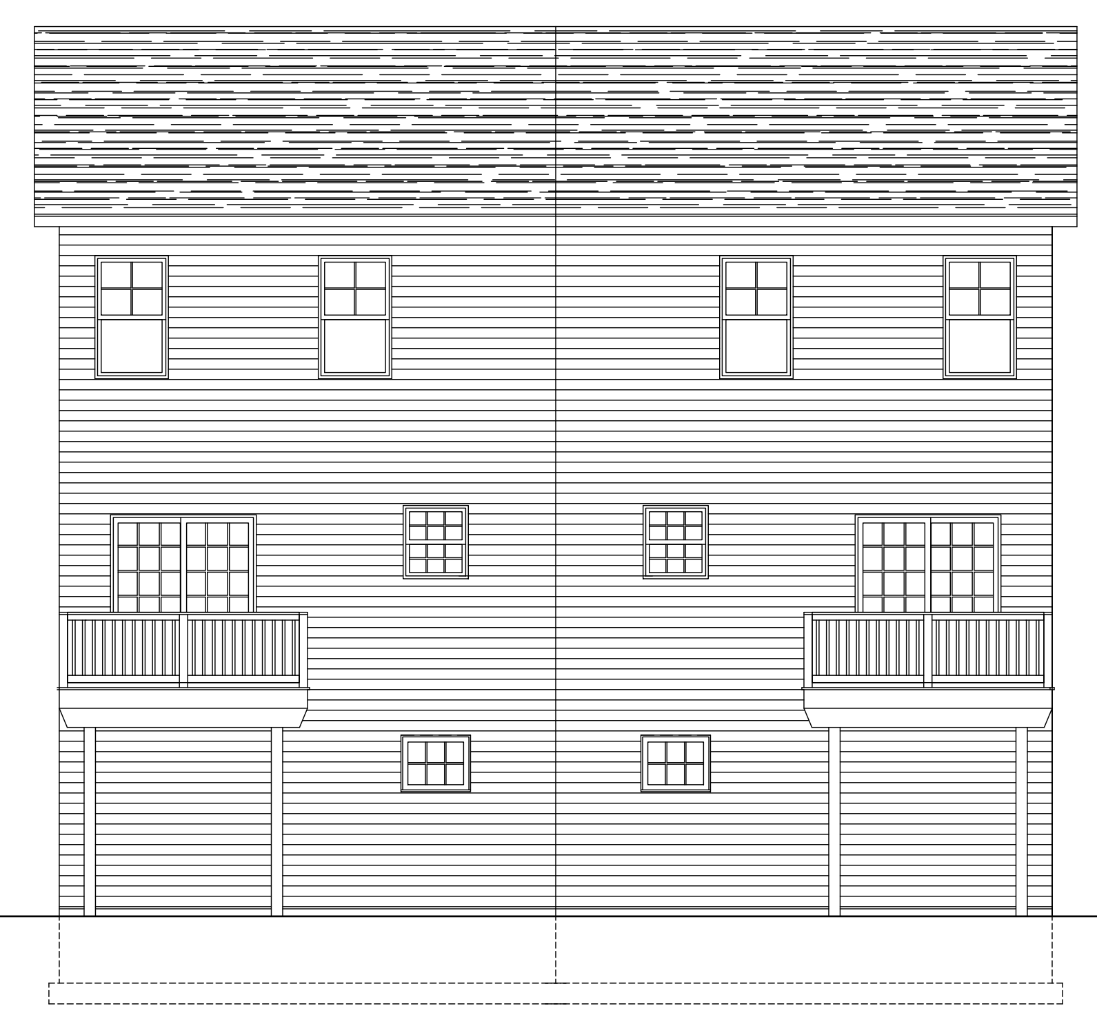
3 REAR ELEVATION SCALE: 3/16" = 1'-0"