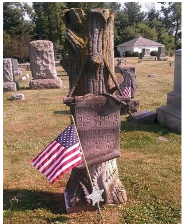
A gravestone in the shape of a tree trunk includes a scroll with the names of the deceased at Chestnut Hill Cemetery.

Those interested in volunteering or purchasing plots can contact Nancy Konhaus Griffie at 717-766-9222. To learn more, visit www.chestnuthillcemetery.com .