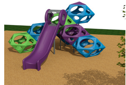
The cube structure offers a new type of climbing adventure.

Friendship Park: Twenty-four paved parking spaces will be added.