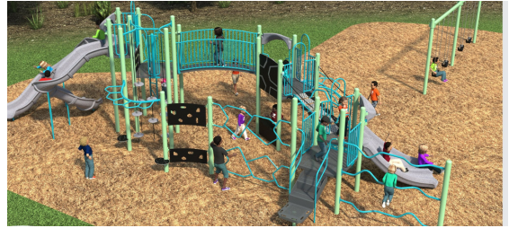
The play area for ages 5-12 includes a swing set.

Upper Allen Township routinely upgrades playgrounds at its 16 parks, and this spring it is Fisher Park's turn to get new equipment. Another piece of good news for youngsters is that, weather permitting, the work should be finished before the end of March.