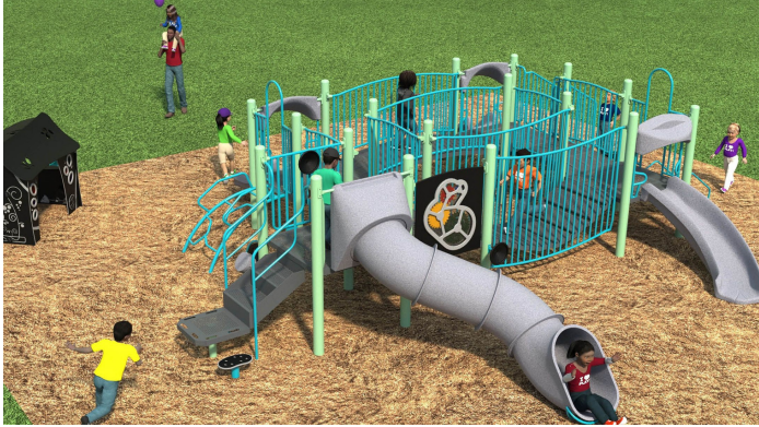
Equipment in the tot lot for ages 2-5 sits low to the playground surface.