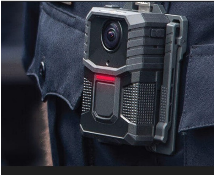
All Upper Allen Township officers will be outfitted with a body camera that attaches to their uniform shirt.

For the first time, Upper Allen Township Police Officers will wear body cameras on their uniforms. All uniformed department officers will wear a camera, which will be used primarily during patrol work.