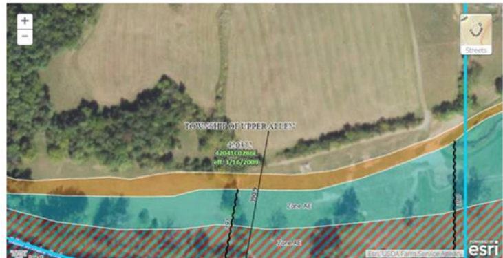
This map shows the different Special Flood Hazard Areas. Web link is msc.fema.gov for a reference.

The Federal Emergency Management Agency (FEMA) began compiling data to update its Flood Insurance Rate Maps (FIRMs) in 2019. FEMA's appeal periods have ended and the flood insurance study and map update is now complete. New flood maps will become effective as of September 7, 2023.