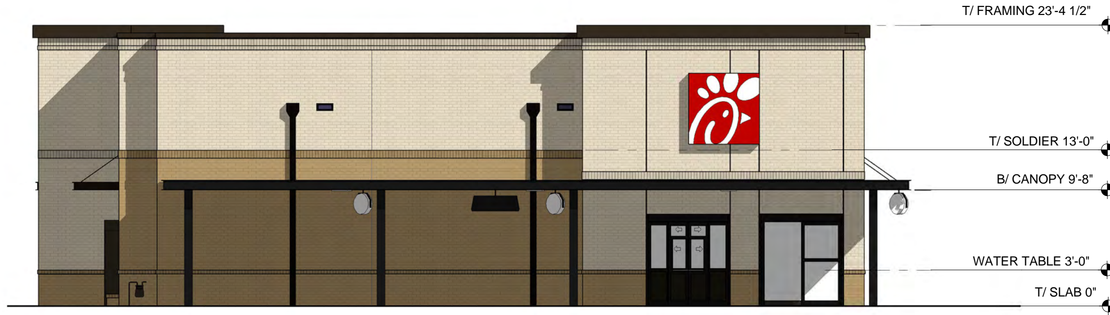
1 EXTERIOR ELEVATION 1/8" = 1'-0"