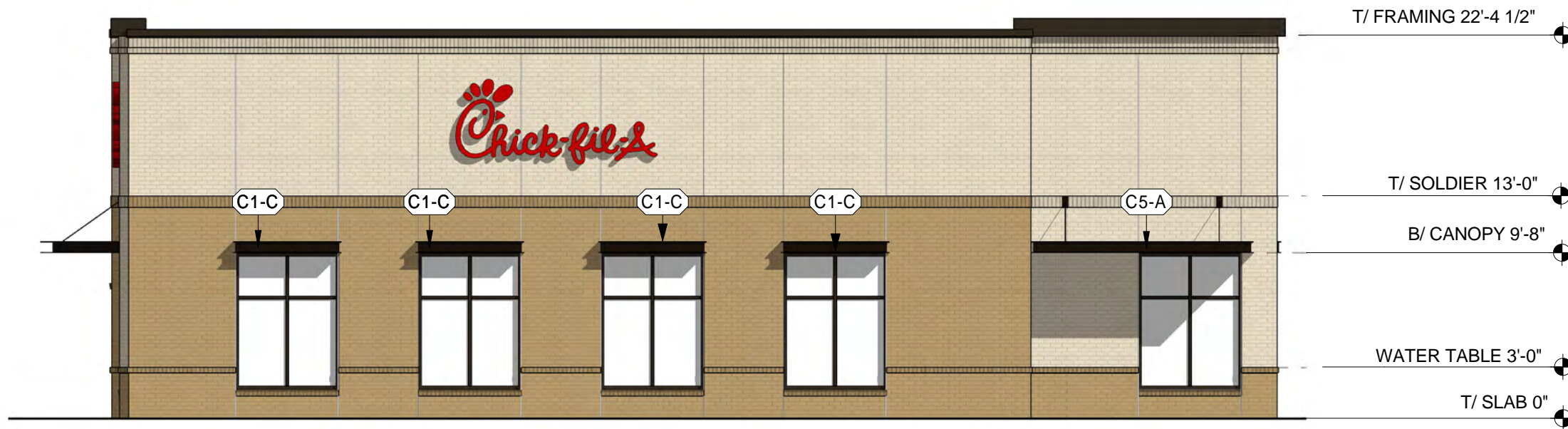
2 EXTERIOR ELEVATION 1/8" = 1'-0"