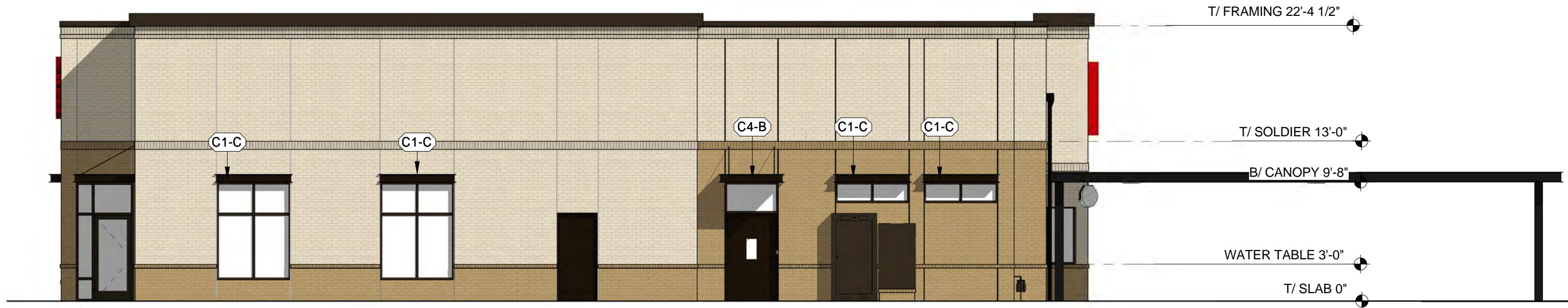
1 EXTERIOR ELEVATION 1/8" = 1'-0"