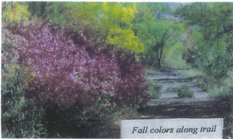
Fall colors along trail