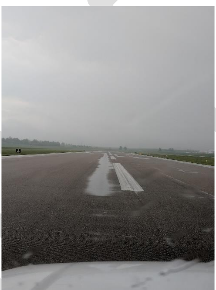
Figure 1: Potential Rutting left of Centerline - 2,000+ feet Southeast of Runway 11 end1

ISN management requested that Burns & McDonnell evaluate the pavements on Runway 11-29 and Taxiway A for the possibility of including larger passenger aircraft into the fleet mix, as well as possible repair options for current distresses on Runway 11-29. Additional aircraft would generally be 76 passenger aircraft (E 175 and CRJ 900). Current distresses include those shown in Figure 1.